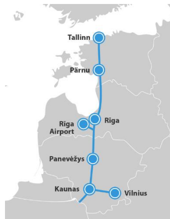
Figure 2. Study Corridor