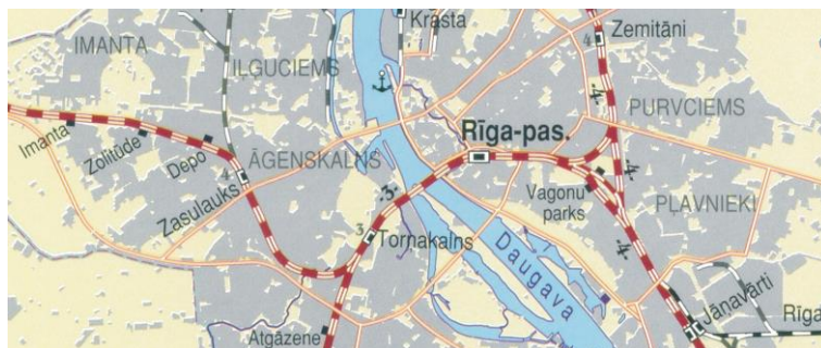
Railway core study area for Riga node Operational Study

8. The performance of the study for Riga node Operational Study requests railway engineering technical and operational analysis, transversal approach from future customers’ needs to realisation of transport offer, and extensive and iterative communication of involved stakeholders to consider and take into accounts various requirements. The study shall be carried out in 4 work packages: