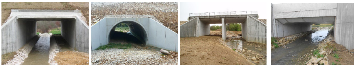
Examples of hydraulic structures with oversizing for animal passage (Rhine / Rhone and East European HSR in France, pictures: Systra)