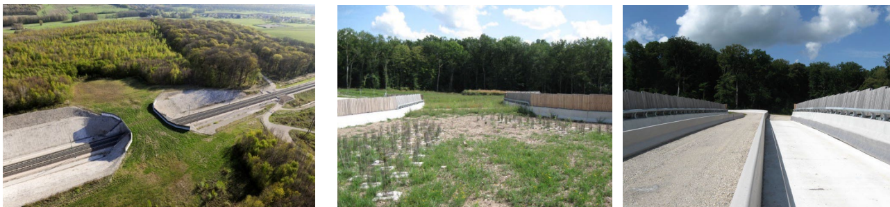
Examples of overpass structures: the two pictures on left side show a specific structure for the passage of animals, and the picture on right side shows an oversizing for animal passage associated with a road (Rhine / Rhone HSR in France)