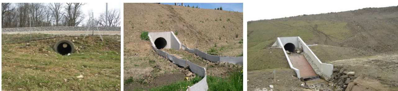
Examples of specific structures for small animals (Rhine / Rhone and East European HSR in France)