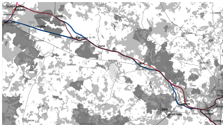
Planned alternatives for territorial planning