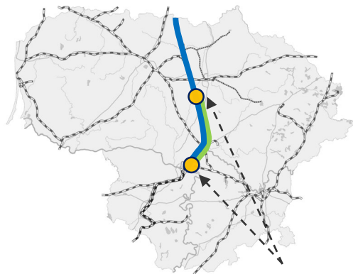
Scope of planned construction works