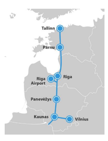
Figure 2. Study Corridor

Table 1. Indicative length of the Rail Baltica railway alignment sections based on Operational plan data