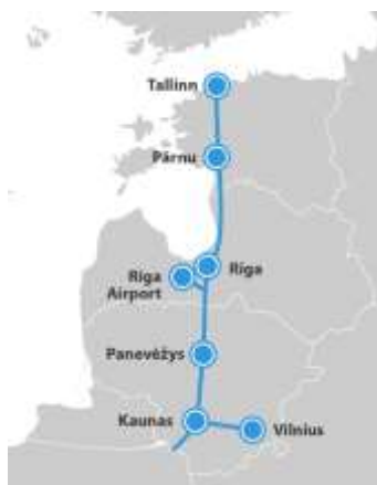
Study Corridor for Architectural, Landscape and Visual Identity Design Guidelines