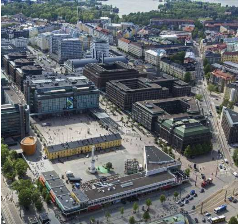
HELSINKI – Extensive and difficult redevelopment of the Helsinki Downtown district -Kamppi

Successful Cities are making sure that a transport investment such as an interchange is implemented jointly with an integrated development plan or an urban regeneration or redevelopment plan , it is more likely to induce economic and social impacts.