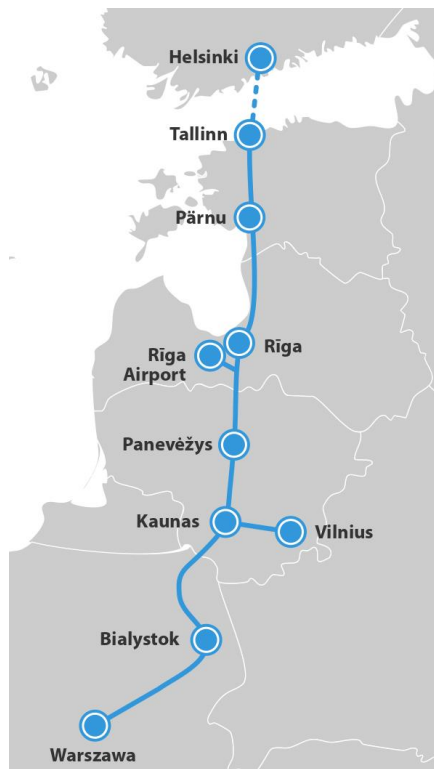
Study Corridor for Operational Plan Concept

2.1.5. The performance of the study for Operational Plan Concept requests extensive railway engineering technical analysis, transversal approach from future customers' needs to realisation of transport offer , and quantitative economic assessment of key elements of railway operation. The study shall be carried out in work packages according to nine general stages: